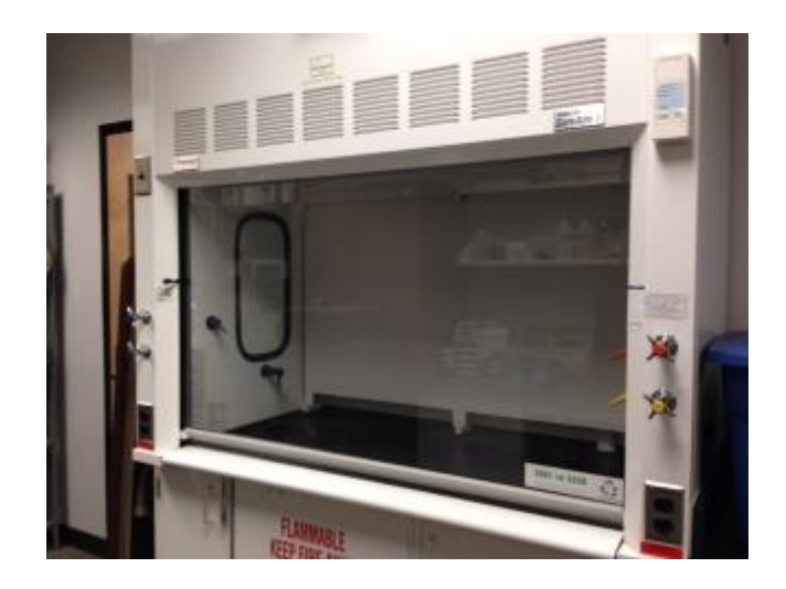
Figure 4.1- Chemical Fume Hood Sash Approved Working Height