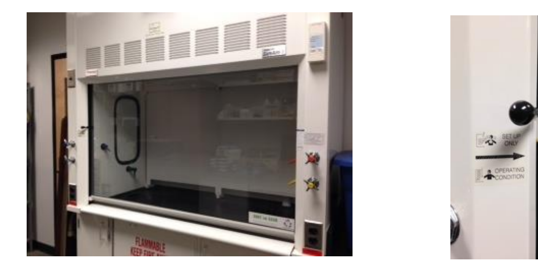
Figure 4.1- Chemical Fume Hood Sash Approved Working Height